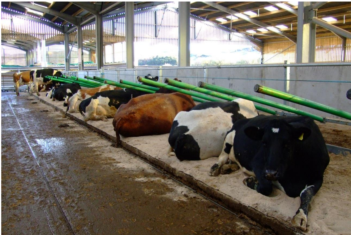
Picture 1 . A combination of cubicle design and adjustment, and low stocking rate, allowed cows to adopt unconventional and undesirable lying positions

Calf-cow behaviour was assessed at the time the cows were going to the milking parlour and observations took place in December 2012. Calves were somewhat unruly, but as calf numbers increased, the majority of them were content to remain in the cubicle area and await their mothers' return. Some calves were occasionally eager to go to the collecting yard, possibly even pass through the parlour, but this did not cause problems. Human appearance (i.e. herdsman arrival) did cause disturbance among the cows and calves, and promoting cow-calf interaction with suckling taking place. Common time of suckling was after the morning milking and feeding. Multiple suckling was also observed occasionally; for example five different cows were observed to have two calves suckling them at once. The "roving" calves generally approached the cow from behind, when her own calf was suckling.