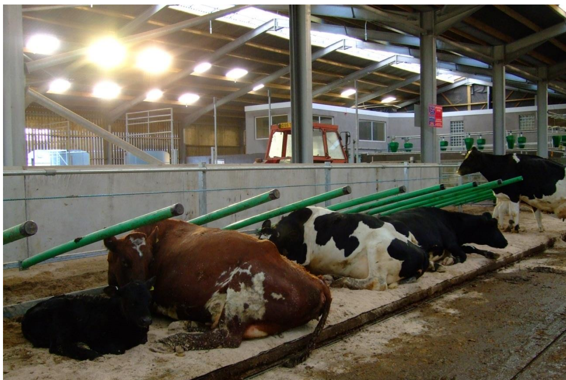
Picture 2 . Calves were able to lie with their dams